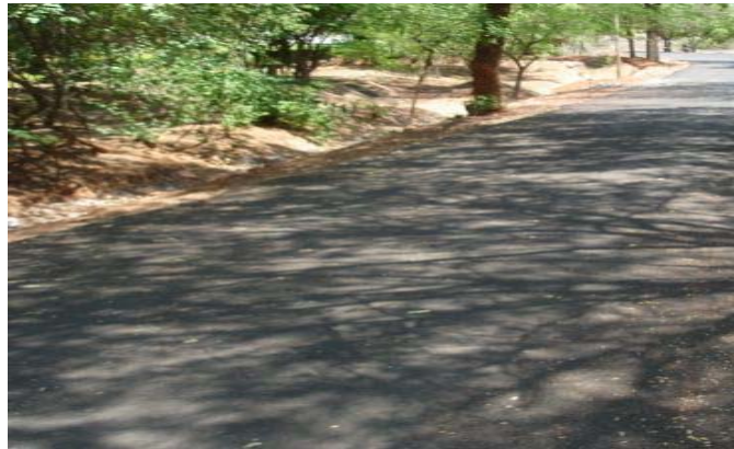
Photo : Canteen road No Pot hole

The road condition survey was taken by walking along the road by a team of five members and the result was absorbed as follows