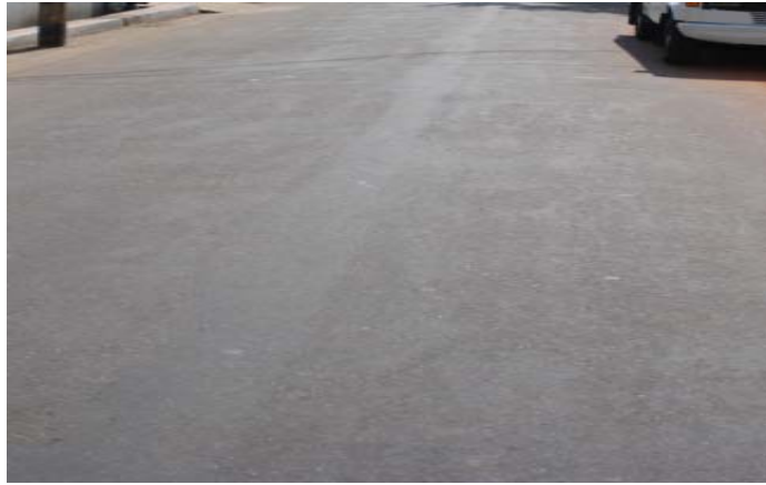
Photo : Veerbadhra Street, Erode

The road condition survey was taken by walking along the road by a team of five members and the result was absorbed as follows