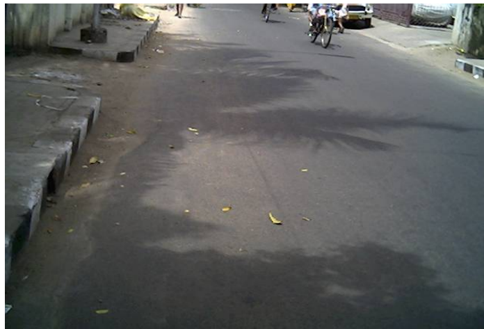
Photo :Jumbulingam road, Chennai

The road condition survey was taken by walking along the road by a team of five members and the result was absorbed as follows