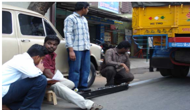
Photo: Testing Of Rebound Deflection Using Benkelman Beam

Benkelman Beam Deflection studies are one of the non-destructive techniques for the structural evaluation of flexible pavements. A well compacted pavement section or one which has been well conditioned by traffic deforms elastically under each wheel load application such that when the load moves away, there is an elastic recovery or rebound deflection of the deformed pavement surface. This is the basic principle of deflection method of pavement evaluation.