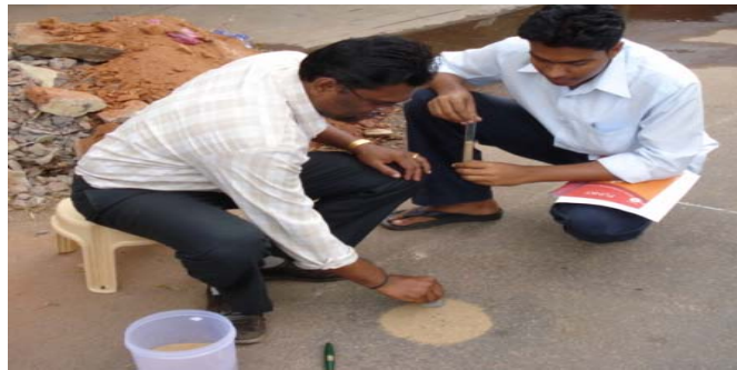
Photo: Sand Patch Test

The ability of bituminous surfacing to provide the required skid resistance is governed by its micro texture and macro texture. The macro texture of the surfacing, as measured by its texture depth, contributes particularly to wet skidding resistance at high speeds by providing drainage routes for water between tyre and road surfaces. The surface condition should include a qualitative assessment of texture in the wheel paths so that it can be used to trigger quantitative testing if required. The sand patch test is described in detail in BS 598 Part 105 (1990). Normally this test is carried out immediately after laying the road. In our case as most of the roads are in good condition the above test was carried out.