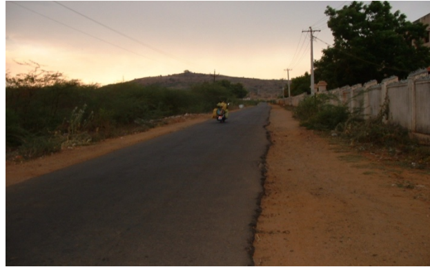
Photo : Vilachery Main road

The road condition survey was taken by walking along the road by a team of five members and the result was absorbed as follows