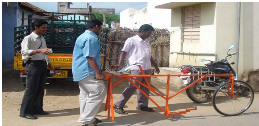
Photo: Testing of Roughness using MERLIN

MERLIN values are the representation of road quality (from the stage of fresh laid road to till date of functioning). The values depends on factors like sub grade level, rolling, traffic load etc. Yet the MERLIN values calculated at different periods correspond to values that represent good quality road, refer Table. From the standard values it is observed that the IRI of Site I to Site V have comparatively better value . Again bitumen road shows higher value exhibiting poor quality of road.