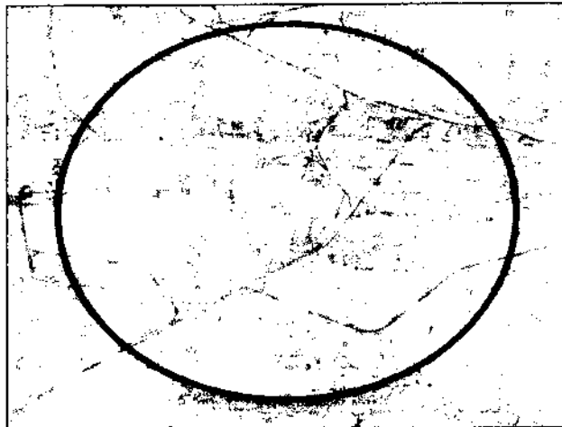
Fig. -2: Boundary (in Red line) of critically polluted area in Asansol ( Burnpur area surrounding IISCO) demarcated by CPCB (Green line shows the area where industries are located within the identified area and have major impact), MoEF Memo No. J-11013/5/2010-1A.11(1) dated 15.03.2010