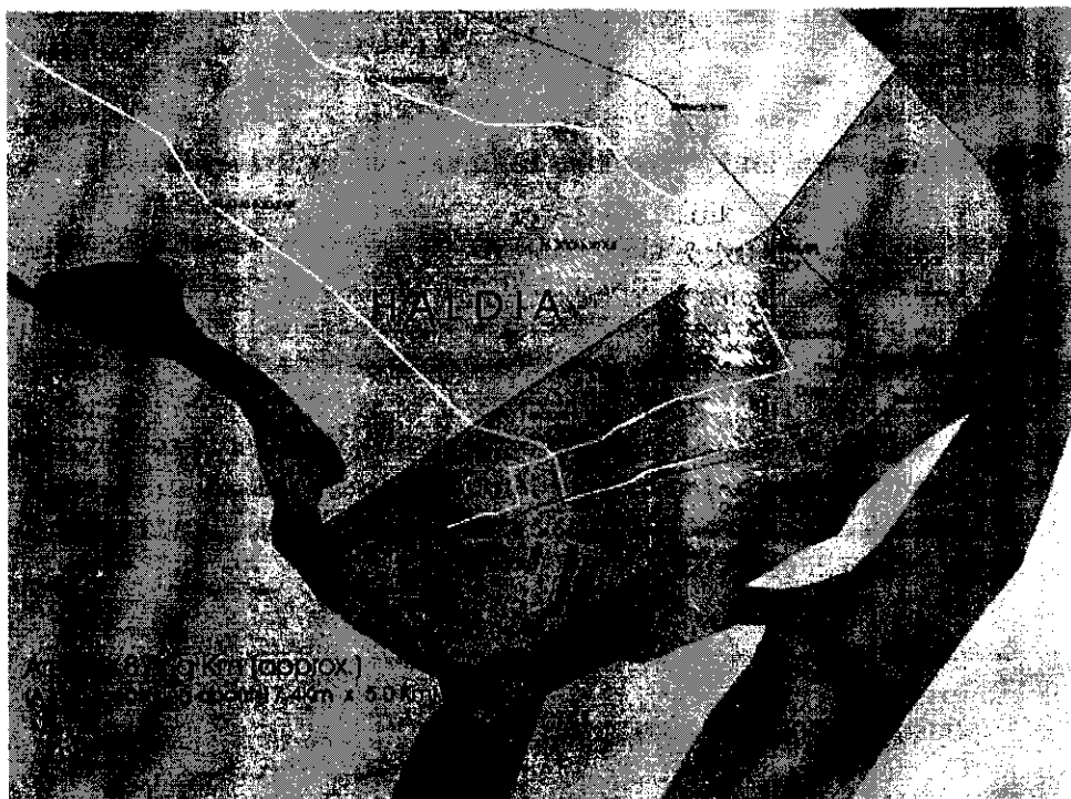
Fig. -I: Boundary of critically polluted area in Haldia as per the MoEF Memo No. J-11013/5/2010-IA.II(1) dated 15.03.2010.

Haldia is located at distance of 125 km South-West of Kolkata and 50 km from the Bay of Bengal at the confluence of three rivers Hooghly, Haldi & Rupnarayan in Purba Midnapore district. Haldia is also one of the biggest ports in the Eastern region and focal point for industrial development in West Bengal. The Haldia Planning Area (HPA) is bounded by the rivers Hooghly, Haldi & Hajli canal and covers a total area of around 326.85 sq. km. spread over 258 mouzas. The HPA is divided in four police stations namely, Haldia, Mahisadal, Sutahata & Durgachak. The area under Haldia police station is completely urbanized and fall within the Haldia Municipal area. The Sutahata police station, which consists of mouzas of both Sutahata I & II blocks, is the largest police station with 75% of the mouzas under rural occupation.