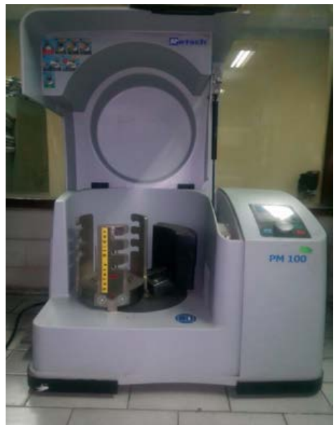
Planetary Ball Mill