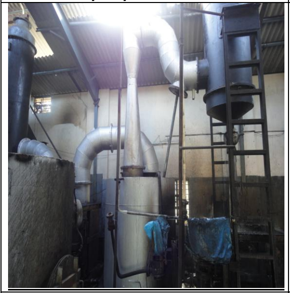
Fig.9: Quencher & Ventury Scrubber