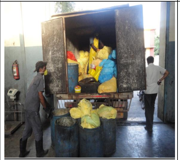
Fig.5: Unloading of Bio-Medical Waste