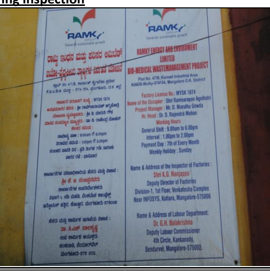
Fig.2: Near the entrance of the factory