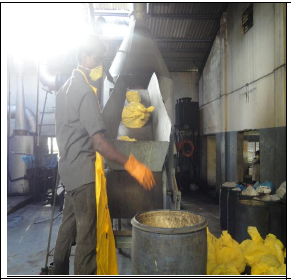
Fig.7: Loading of Bio-Medical Waste in Conveyer system