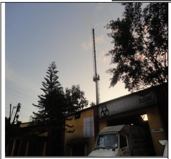
Fig.1: M/s Ramky Energy & Environment Ltd.