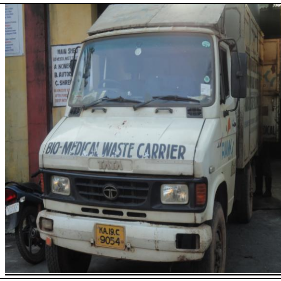
Fig.4: Vehicle used to transport Bio-Medical Waste