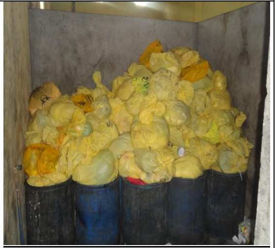
Fig.6: Storage of Bio-Medical Waste