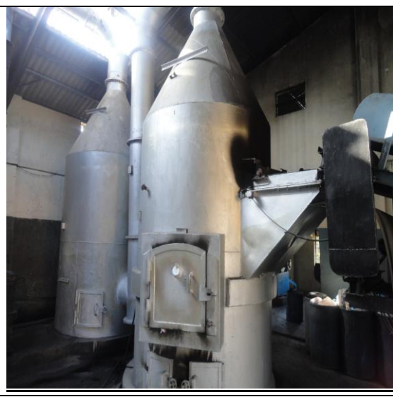
Fig.8: Primary & secondary chambers