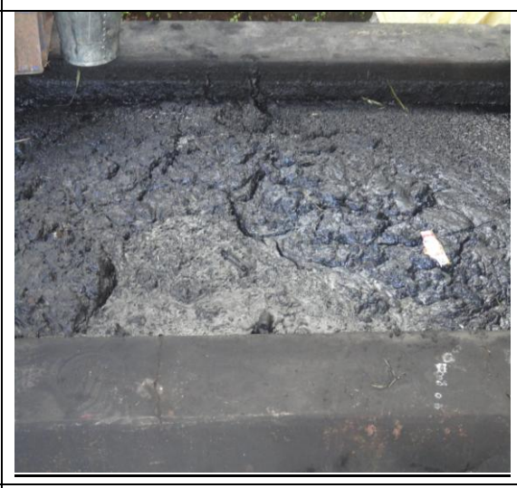
Fig.12: Sludge Drying Bed