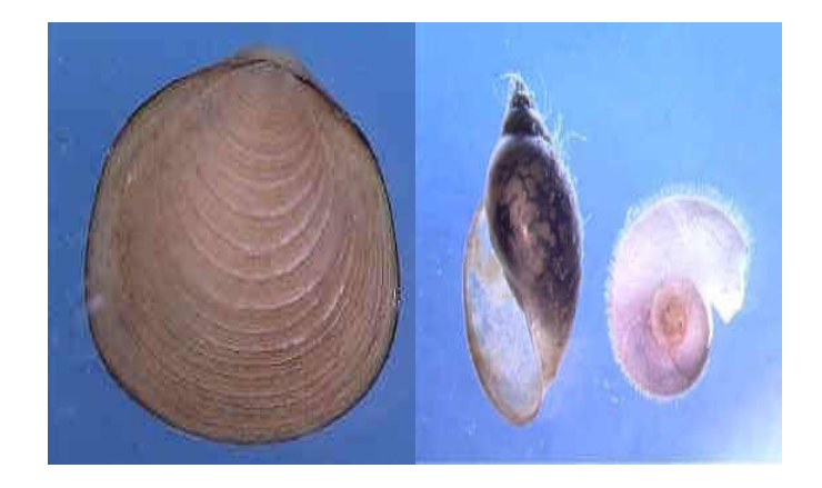
FIG.3: POLLUTION TOLERANT TAXA