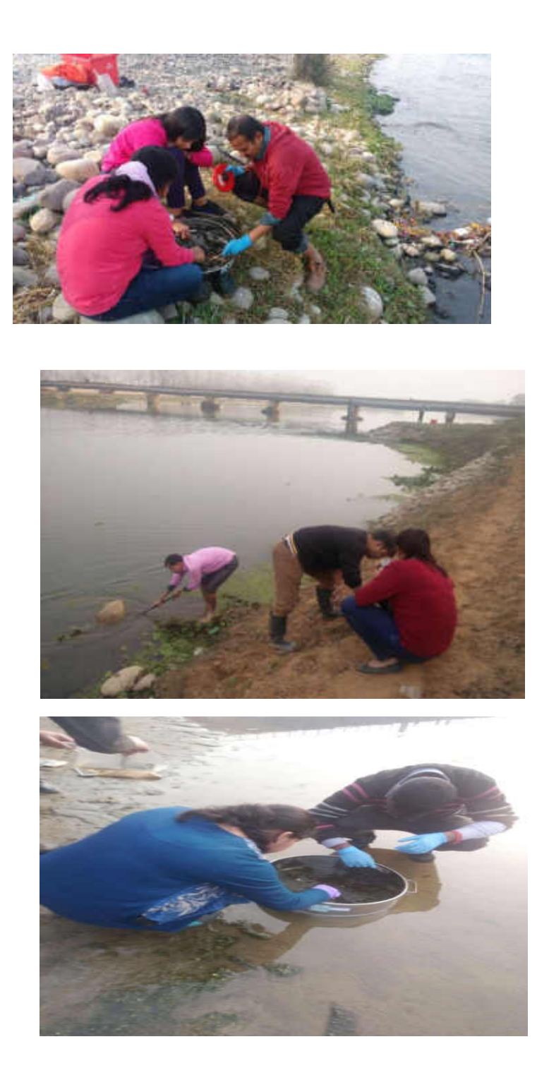
Fig. 4. Benthic Macroinvertebrates Sample Collection at River Ganga